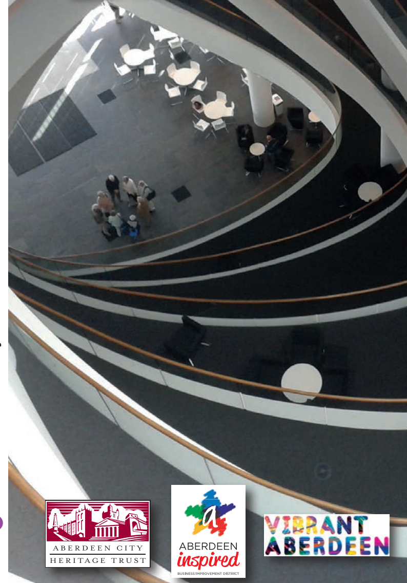
Cover: 39 The Sir Duncan Rice Library

www.facebook.com/AberdeenDoorsOpenDay www.facebook.com/dodscotland